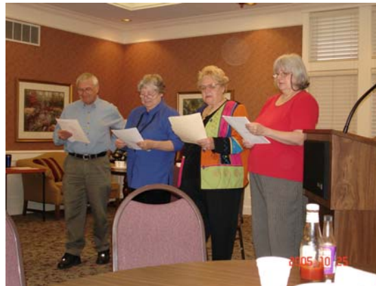
Vintage Players Program